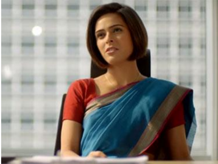
Picture of Airtel mobile company advertisement

This question largely deals with the Gender element of the advert. It includes the argument that which gender is targeted to appeal to? Is it men, women or both? This helps us to construct or reconstruct the image of represented gender.